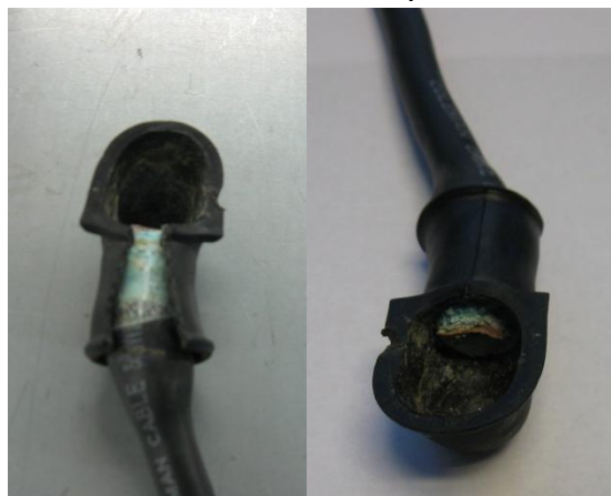
Result of old