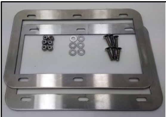
Tank Support Kit #700-7015D